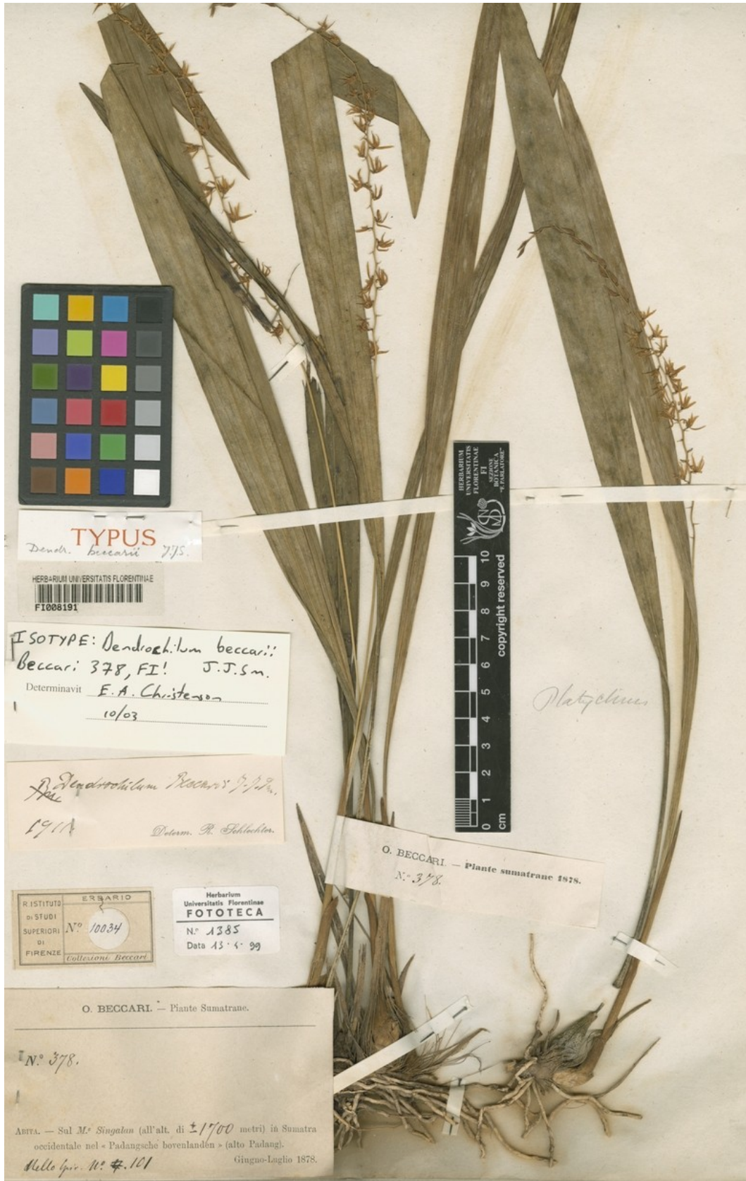
This is an Isotype held at the Florence herbarium in Italy.