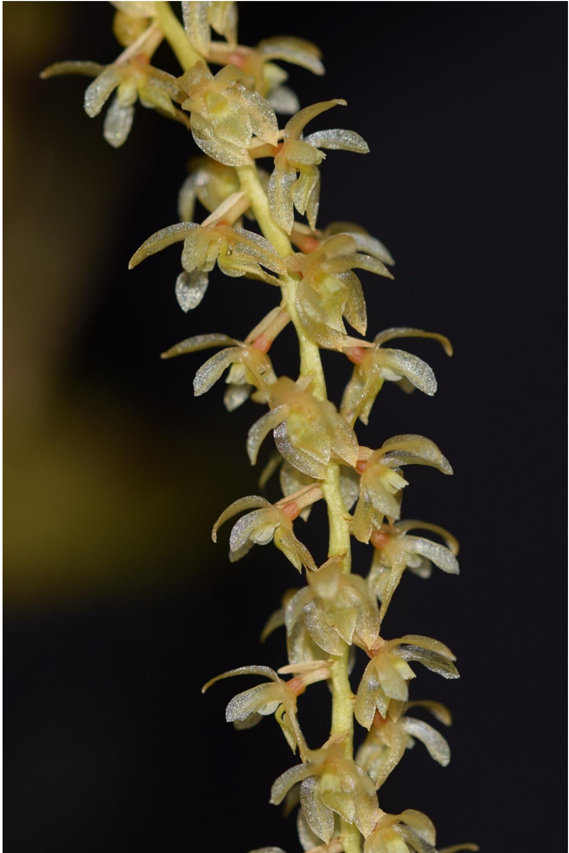
Above