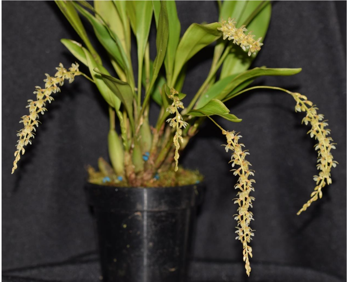
Above: photos taken by Trey Sanders of a plant in cultivation. ©.