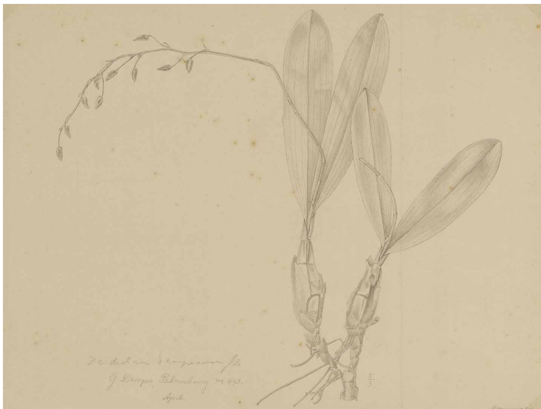
An illustration by an unknown person