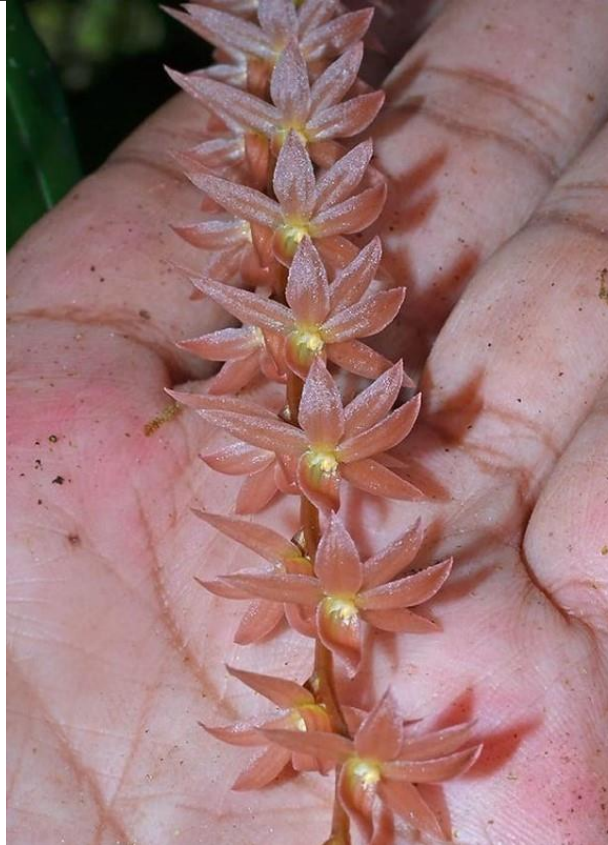
The photos above were taken by Frankie Handoyo at 1,500m in Aceh and are used with permission. ©